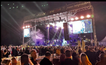
VIEW FROM THE ROCKSTAR CABANA