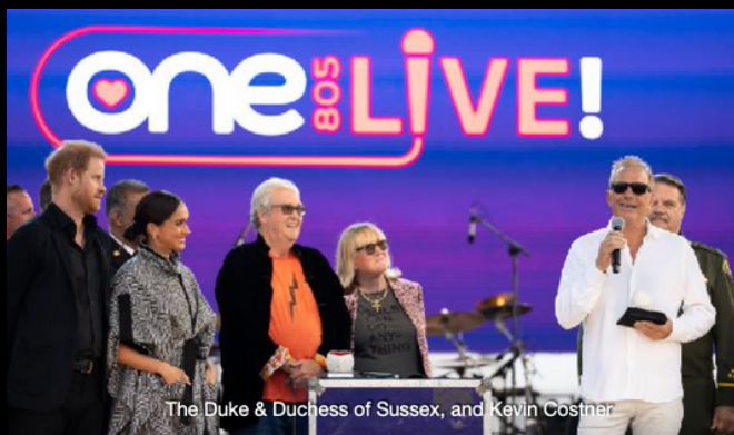
The Duke & Duchess of Sussex, and Kevin Costner

Your donation will help fund our First Responder counseling program, with the goal of securing support three years in advance.