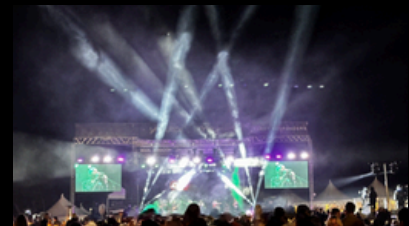
VIEW FROM THE DIVA CABANA