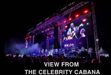
VIEW FROM THE CELEBRITY CABANA